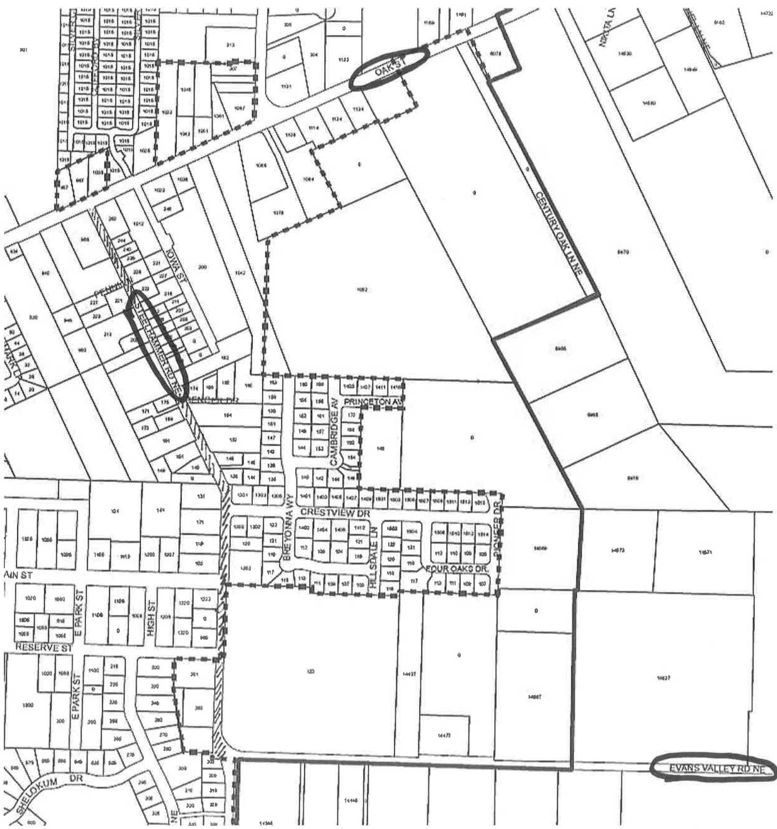
Exhibit A - Steelhammer Rd